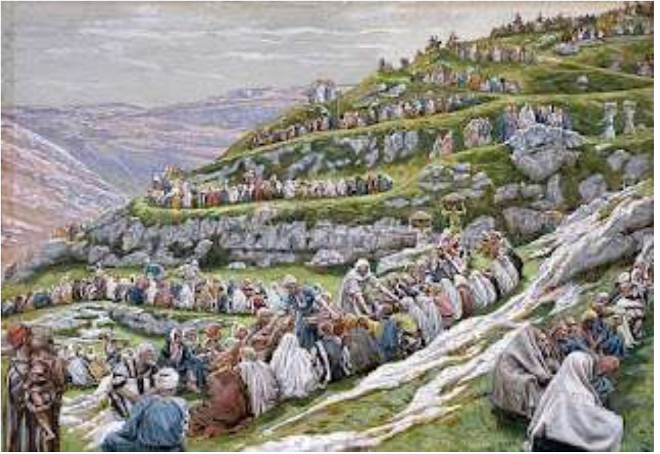
The Miracle of the Loaves and Fishes, Artist: James Tissot (1836–1902)